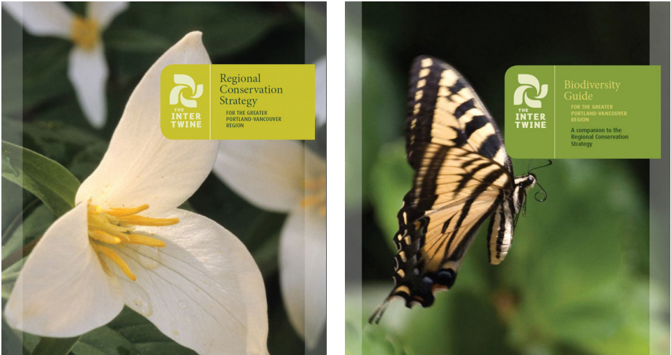
Figure 4. (Left) Cover of Regional Conservation Strategy ; (right) cover of Biodiversity Guide .

Had this project been taken on by a single entity or by a government agency, which is less nimble and operates under different constraints than a nonprofit coalition, it would have taken far longer and cost significantly more than the nonprofit-led collective impact collaborative effort we adopted. Armed with the high-resolution mapping and modeling results, The