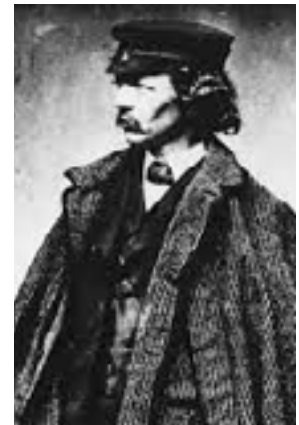
Frederick Law Olmsted, Sr.